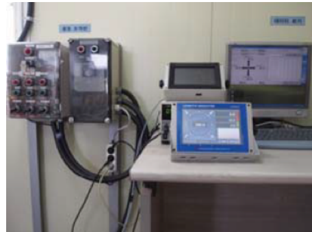
FIG. 1. A figure caption. The figure captions are automatically numbered.

The analog of the figure environment is table , which uses the same \caption command. However, you should